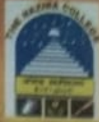
Talpakay High & M.P. School

Study on Adjustment Ability of School Student in the area of Naharkatia namphak, Dibrugarh District, (ASSAM)