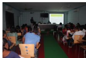
UGC Sponsored National Workshop on 'Role of ICT in Higher Education