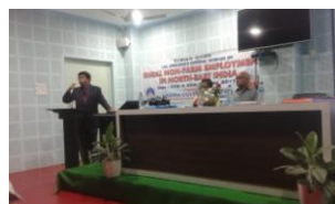
UGC Sponsored National Seminar on Rural Nonfarm Employment In North East India