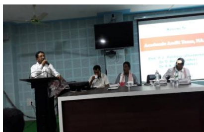
Exit Session with Academic Audit Team, 2017