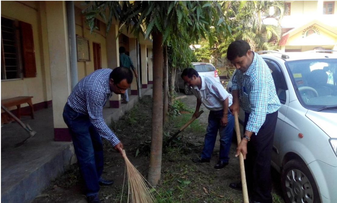
CLEANESS PROGRAMME DONE BY PRINCIPAL AND TEACHERS OF OUR COLLEGE