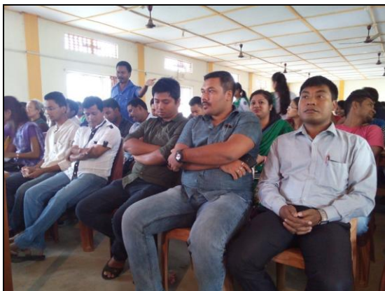
An ALUMNI delivered his speech