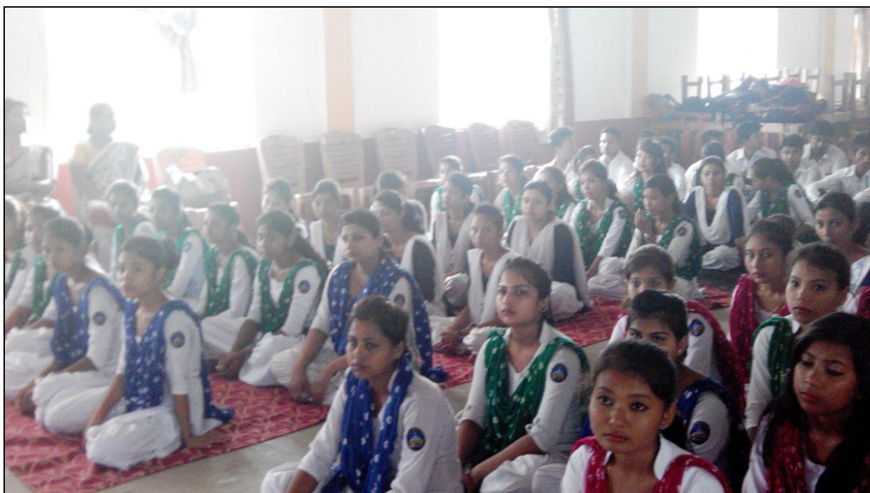
Students Participants in Life Skill Development Workshop