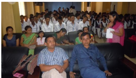
CAREER COUNCELLING PROGRAMME