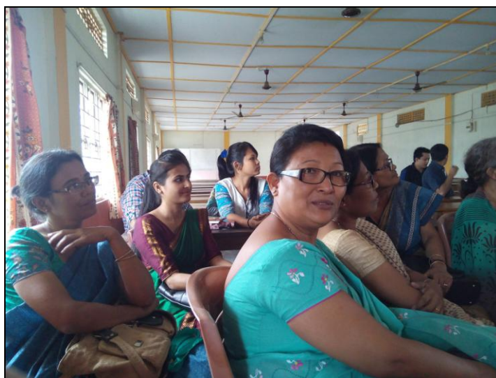
Part of our Teachers in Alumni MEET