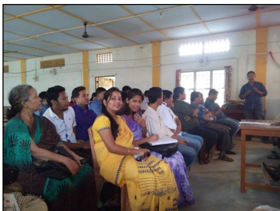
An ALUMNI delivered his speech