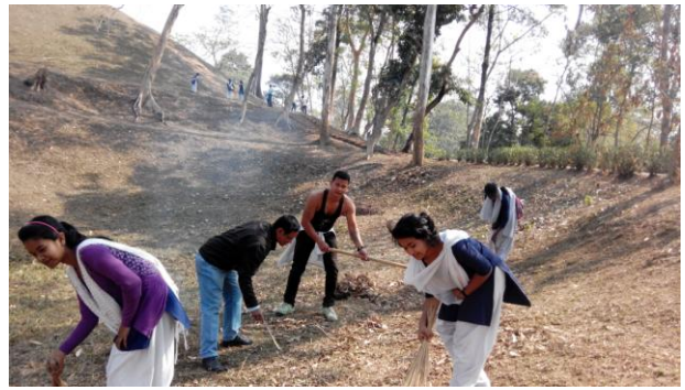
CLEANSNESS PROGRAMME BY NSS