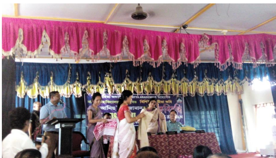
‘KABI SANDHI’ – Organised by department of Assamese