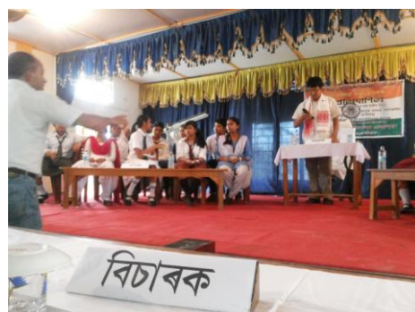
All Assam Quiz Competition