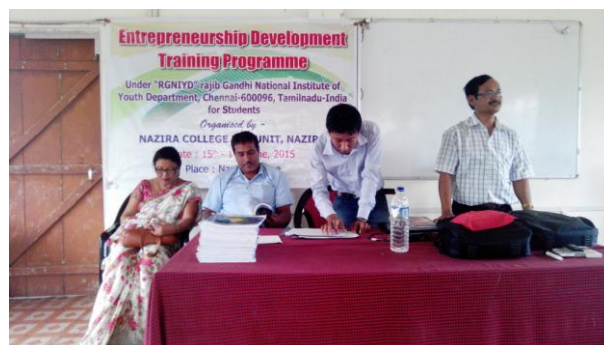
ENTREPRENURESHIP DEVELOPMENT TRAINING PROGRAMME ORGANISED BY NSS