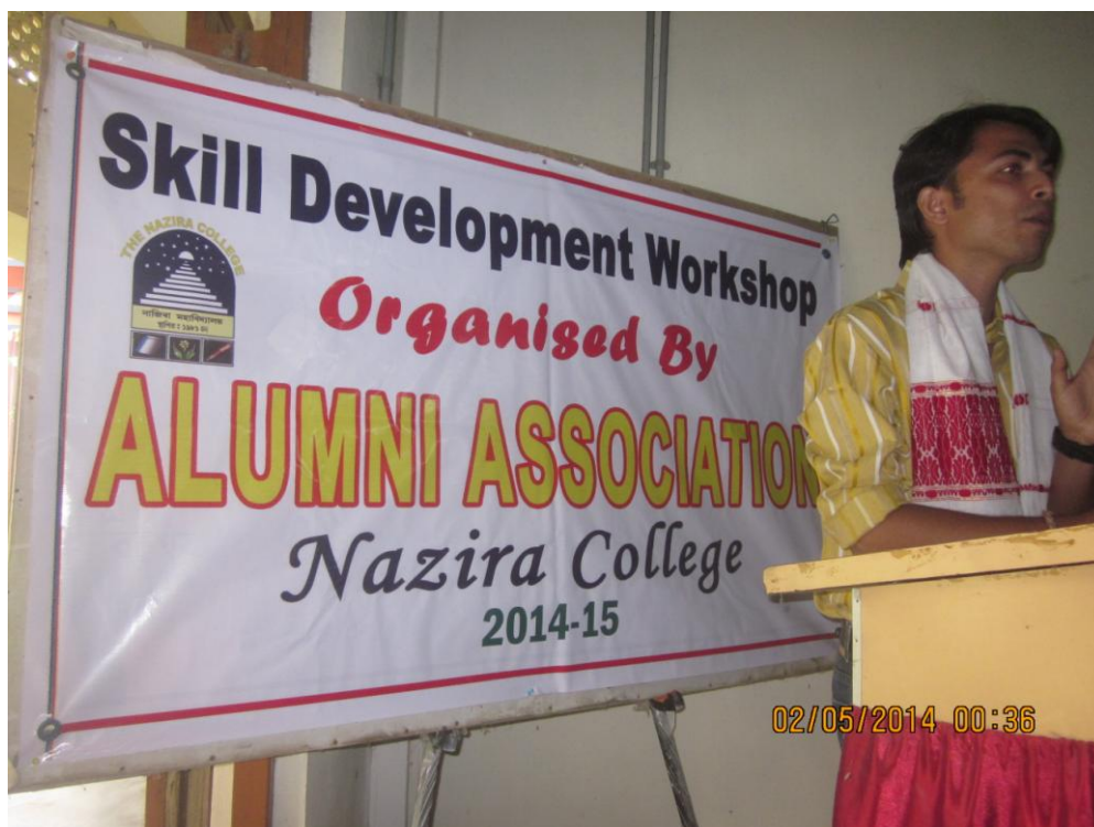
SKILL DEVELOPMENT WORKSHOP BY ALLUMNI ASSOCIATION