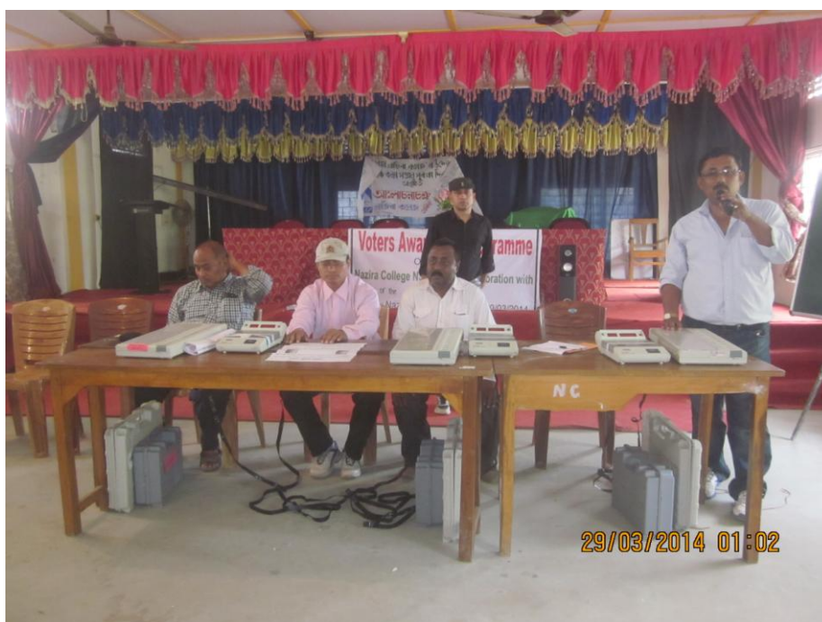
VOTER AWARENESS PROGRAMME