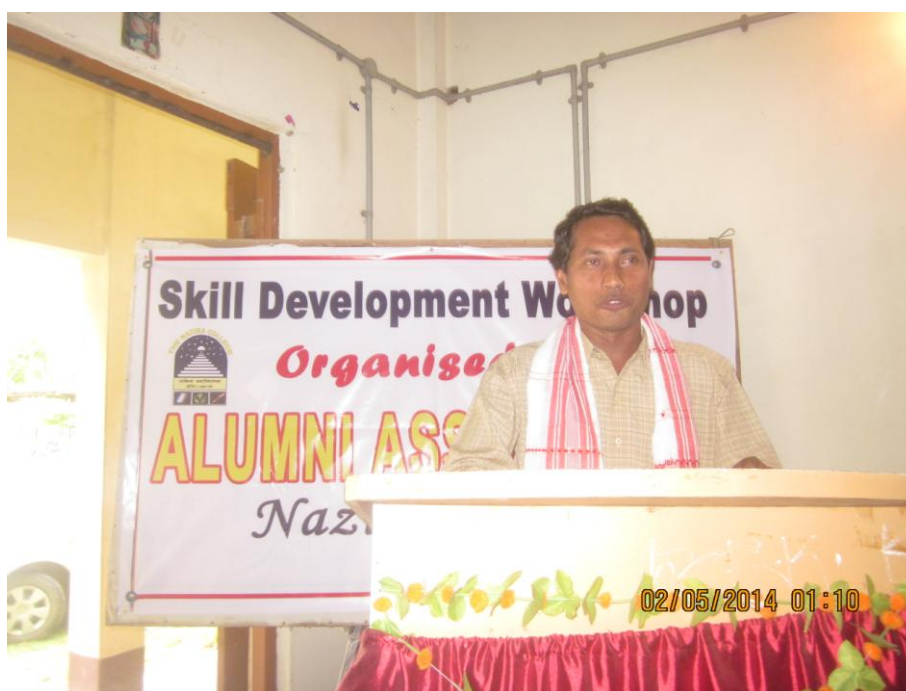
SKILL DEVELOPMENT WORKSHOP BY ALLUMNI ASSOCIATION