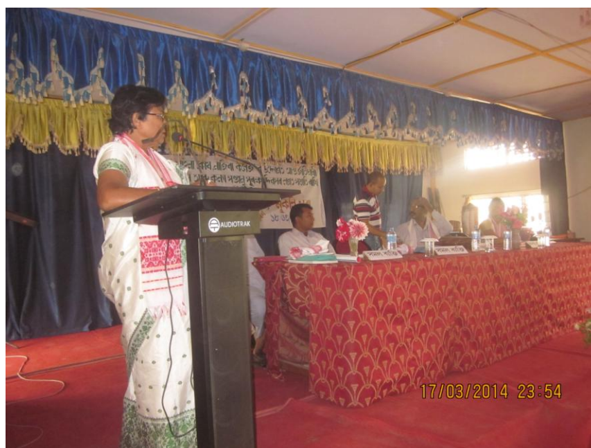
CELEBRATION OF INTERNATIONAL WOMENS DAY