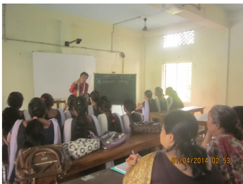
WORKSHOP ON FASHION DESIGNING