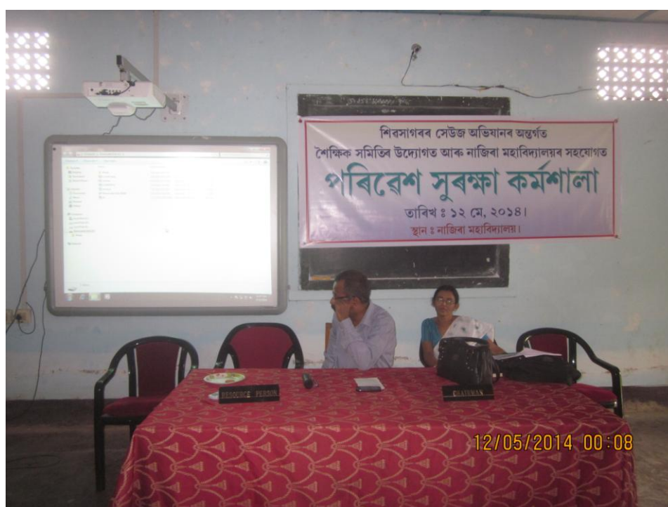
ENVIRONMENT PROTECTION PROGRAMME