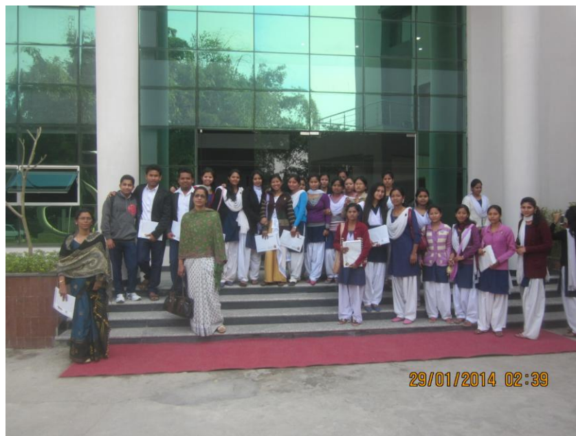
COLLEGE TEAM IN KAZIRANGA UNIVERSITY