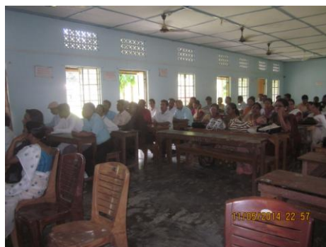
ENVIRONMENT PROTECTION PROGRAMME