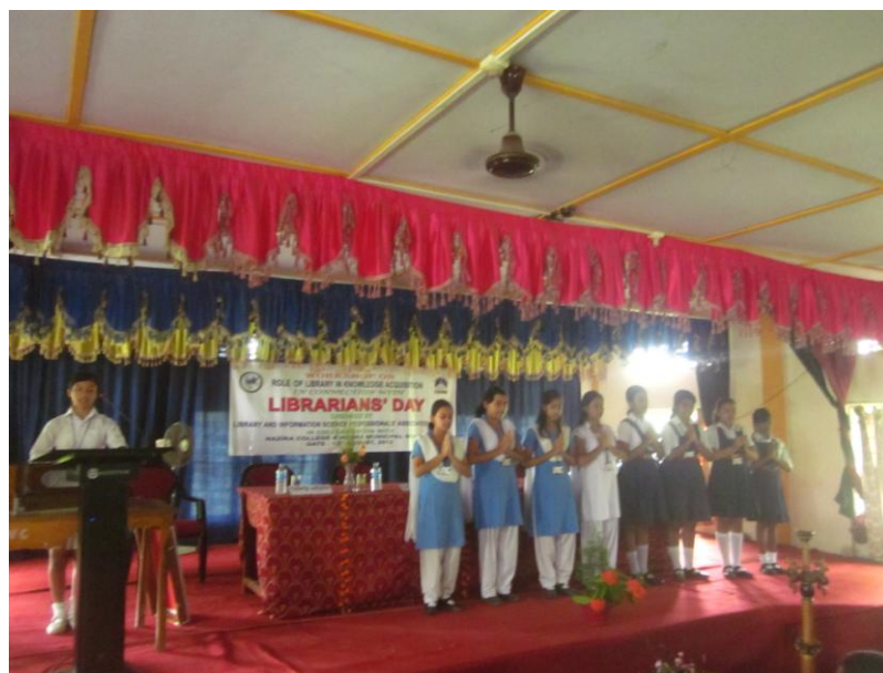
OBSERVATION OF LIBRARIAN DAY